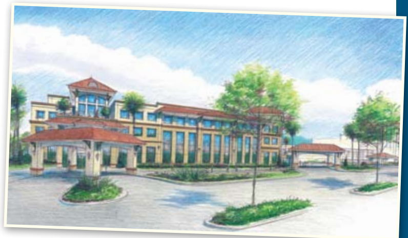
Artist's rendering of the new cancer center at Leesburg Regional Medical Center. Completion date is scheduled for late 2011 to early 2012.