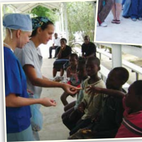
Our medical volunteers offering treats to Haitian children