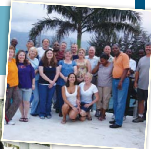
The Alliance medical team volunteers on their trip to Haiti to provide medical care.