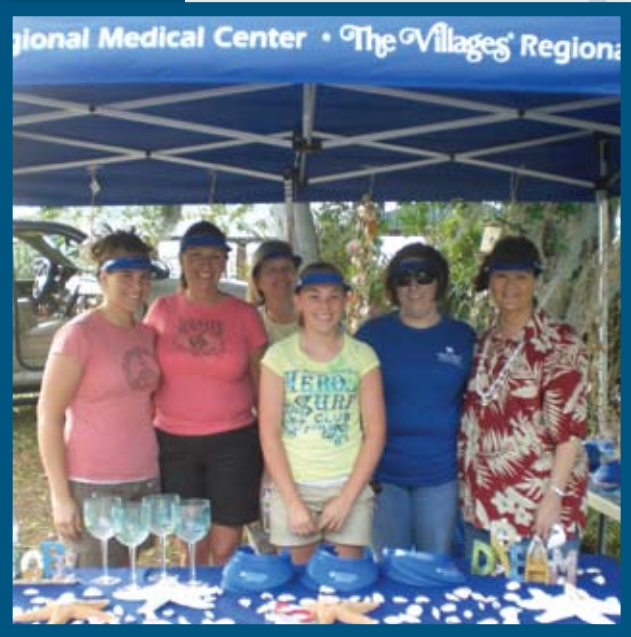
Leesburg Regional team members raise money and participate in the annual March of Dimes March for Babies each year. Leesburg Regional welcomed 1,411 babies into the world in 2008 and 1,337 in 2009.