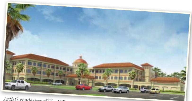
Artist's rendering of The Villages new cancer center. Completion date is scheduled for late 2011 to early 2012.